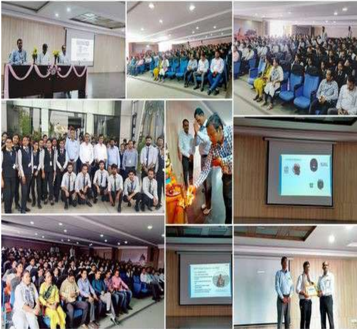
Awareness Program on the Topic "Use of Helmets to Prevent Brain & Spinal Cord Injuries"