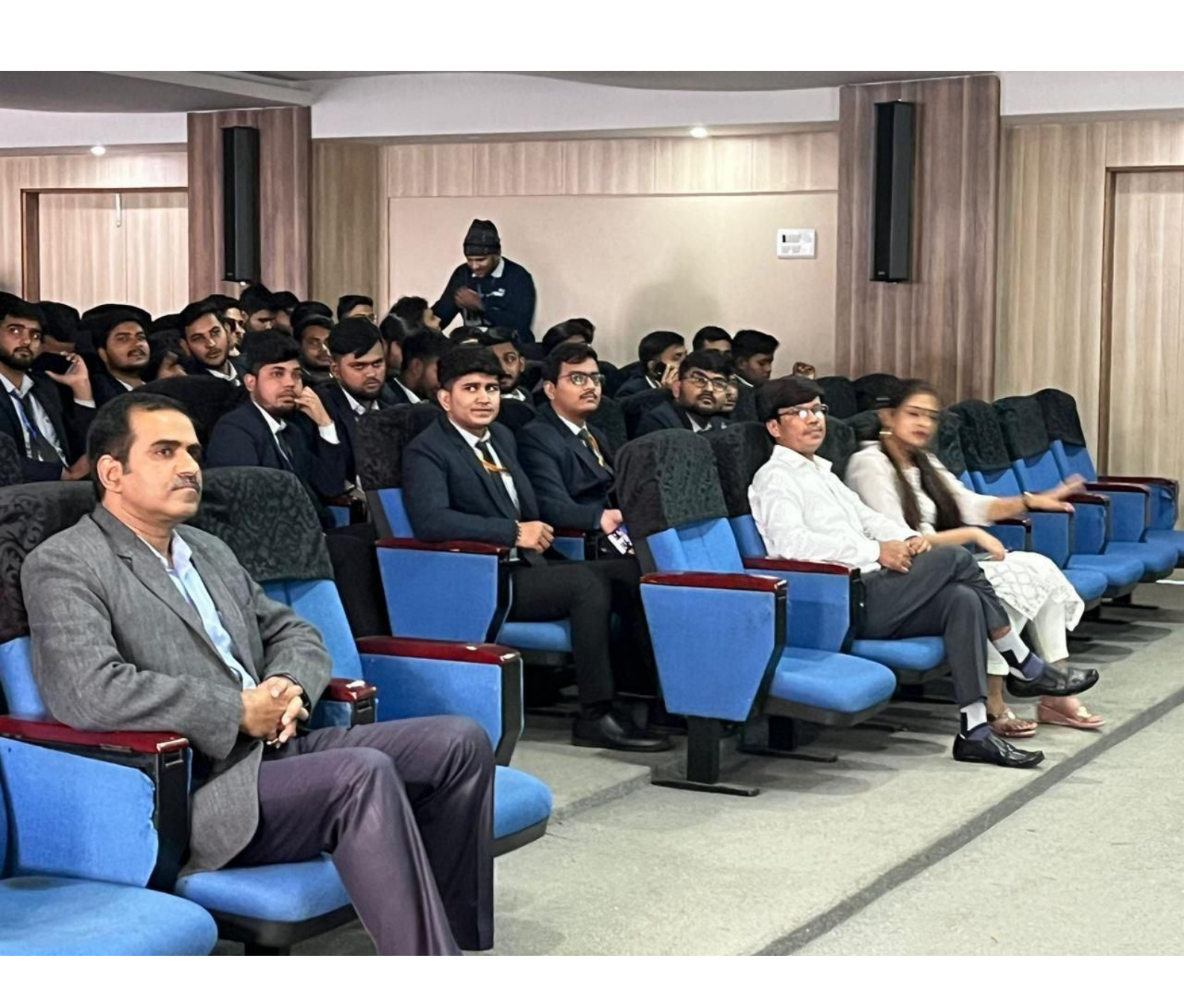
SELF MANAGEMENT SKILL PROGRAMME SESSION