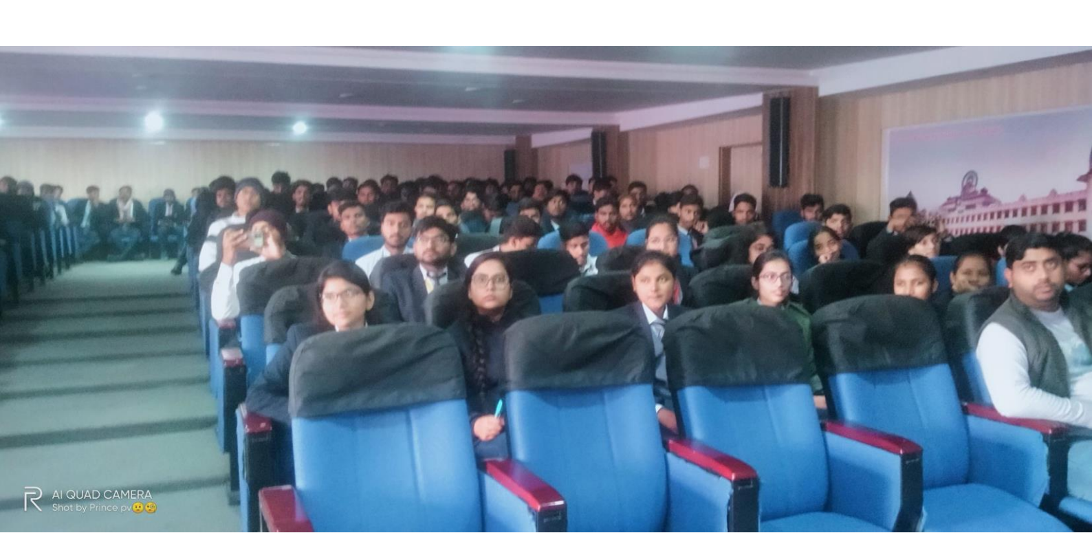
ORGANIZATIONAL SKILL DEVELOPMENT SESSION