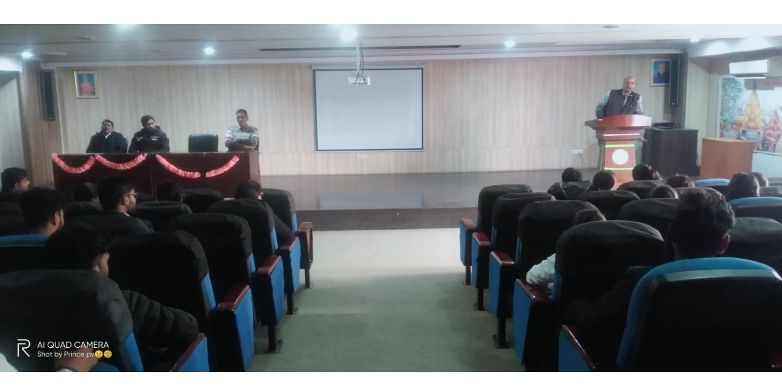
ORGANIZATIONAL SKILL DEVELOPMENT SESSION BY RESOURCE PERSON