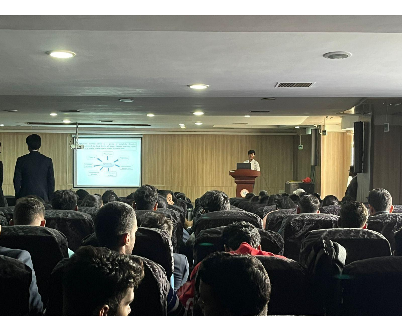
LEADERSHIP SKILL DEVELOPMENT PROGRAMME