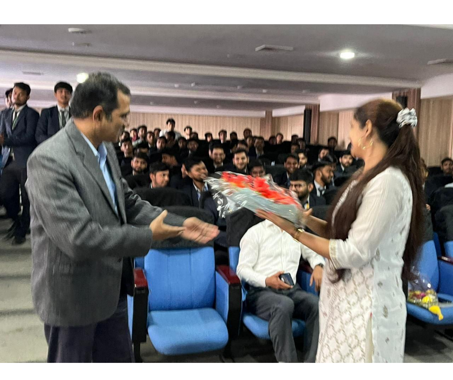
WELCOMING GUEST BY GIVING BOUQUET