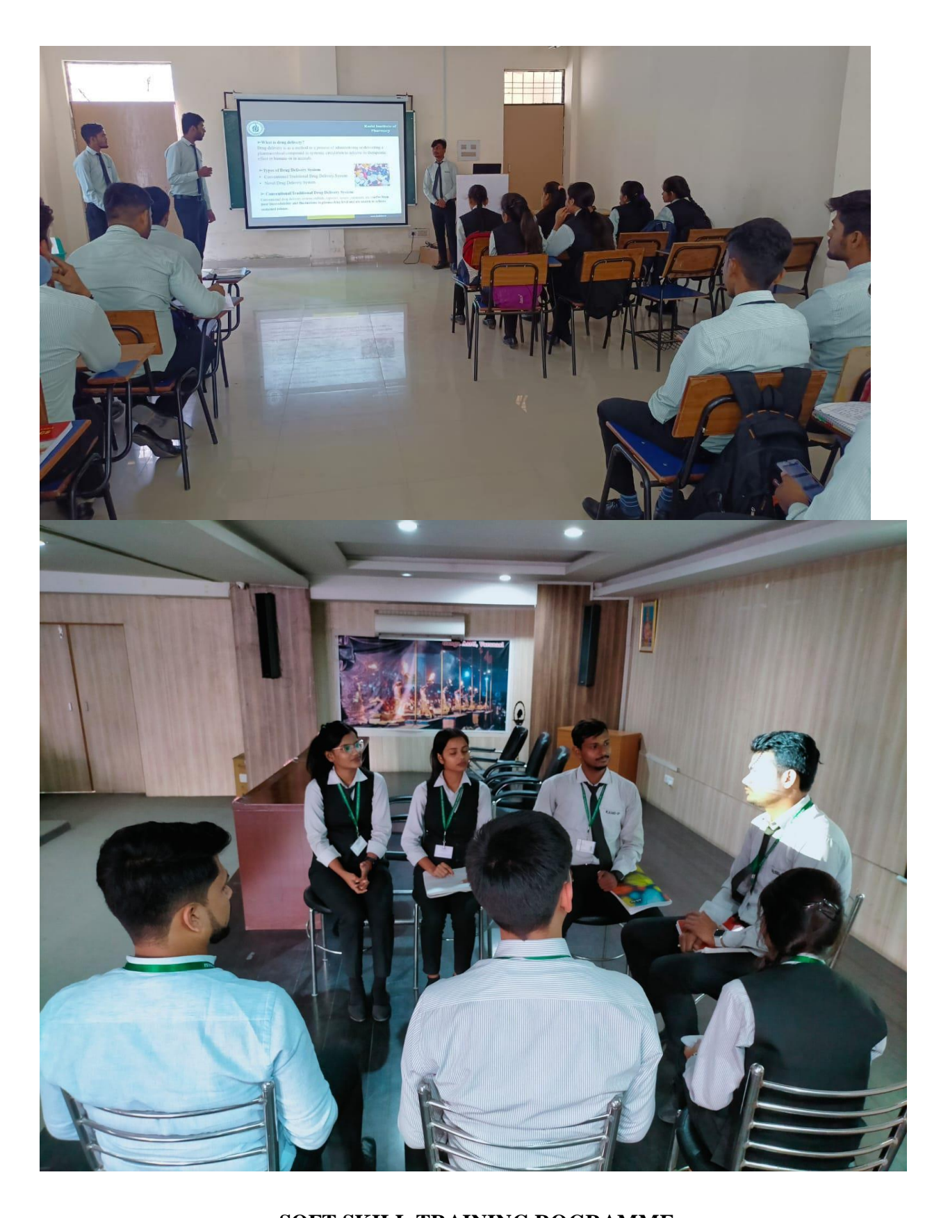
SOFT SKILL TRAINING ROGRAMME